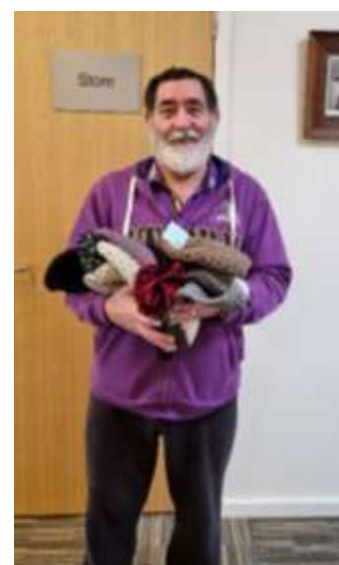
Beanies for the Seaman's Mission