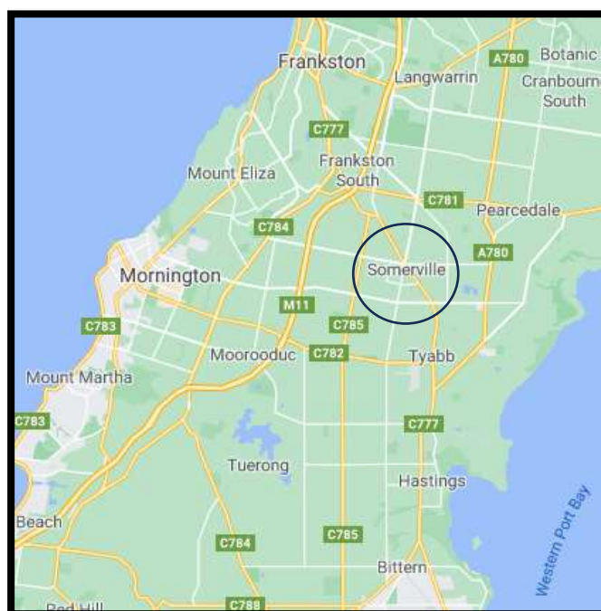
Somerville, Mornington Peninsula, Victoria