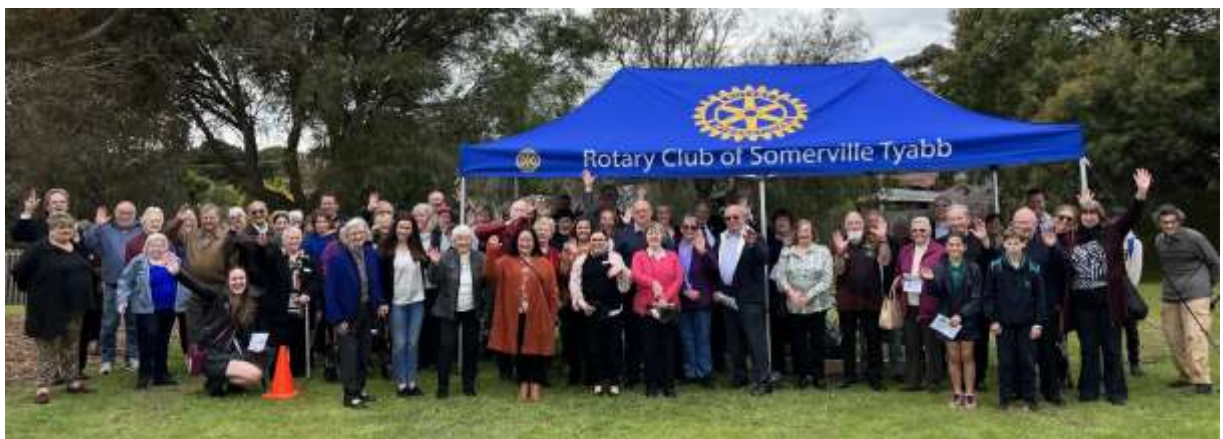
Queen's Jubilee Commemorative Event